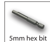
5mm hex bit

A variation of bore size of 10.5mm -11mm for Insert Screw (F) may be required for hardwoods or when drilling into end grain. Use waxing or lubrication if required to level Insert Screw flush in the material. If required countersink hole to ensure Insert Screw is flush or below surface level of material.